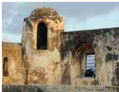
5. Fort Jesus