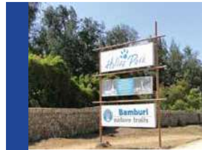
3. Haller Park