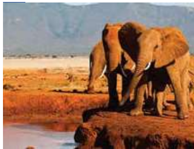
2. Tsavo East National Park