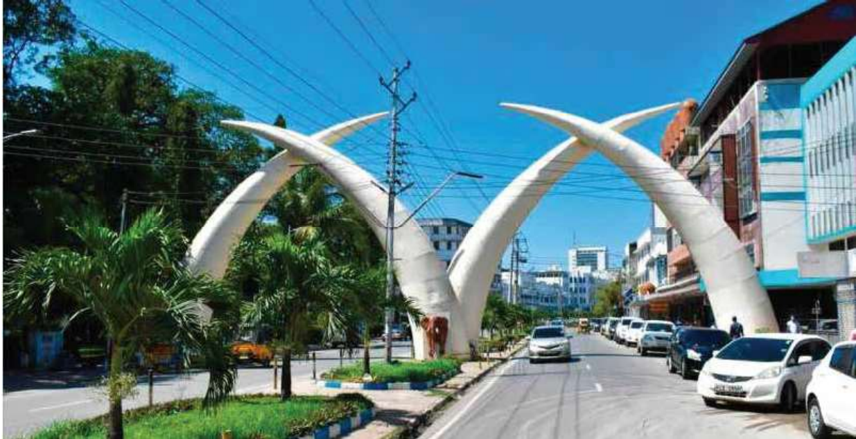
Tusks of Mombasa