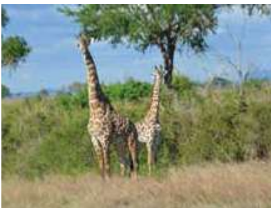
4. Wild Waters