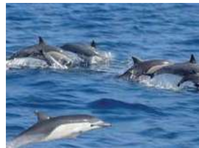
Swimming with the Dolphins