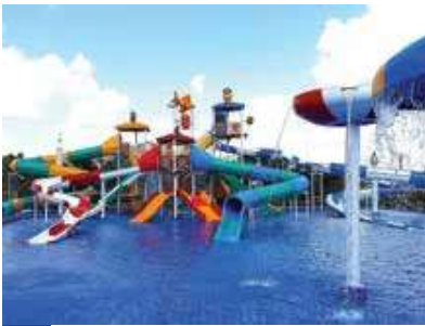
1. Wild Waters