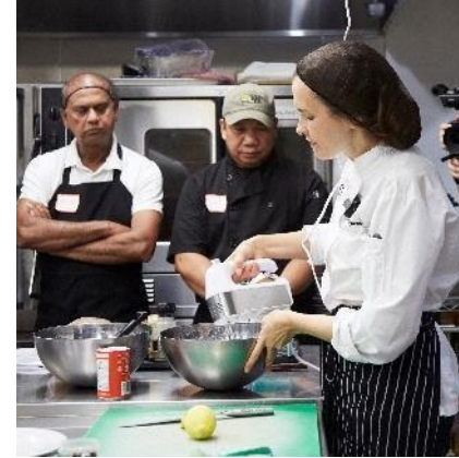
Menu redesign (~20% plant-forward).