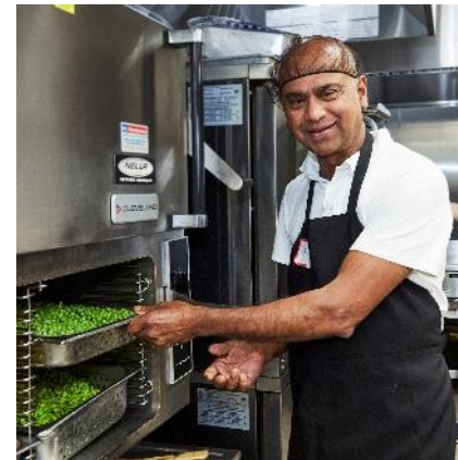
Pilot → measure → scale