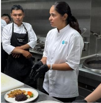
Hands-on culinary training (on-site)