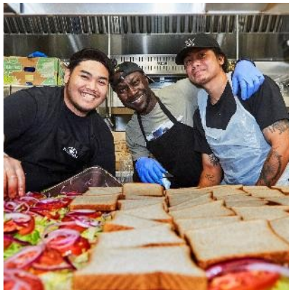
Marketing & positioning support