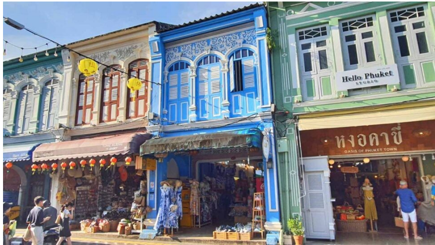
Phuket Old Town Visit - Sino Portuguese Architecture - Outdoor Education i