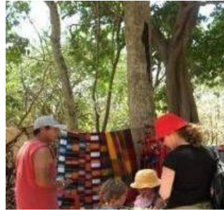
Social & Economic