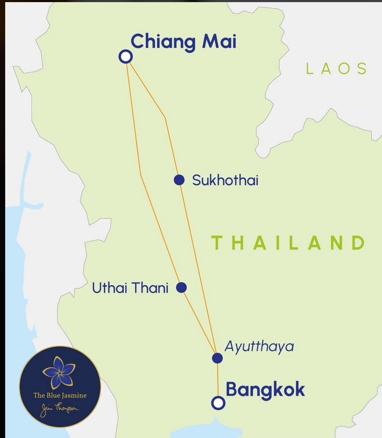
The Blue Jasmine Route 9 Days 8 Nights