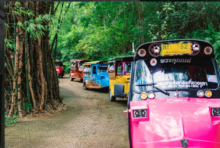
Scenes Along the Tracks Experience the landscapes, cabins, and culture through our curated gallery.