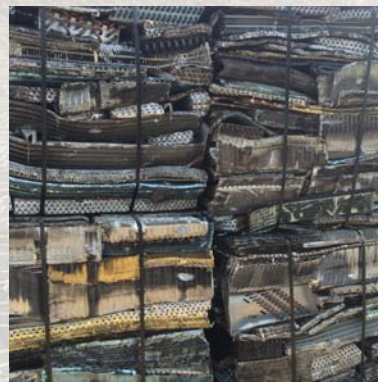
Aluminum Scrap Talk