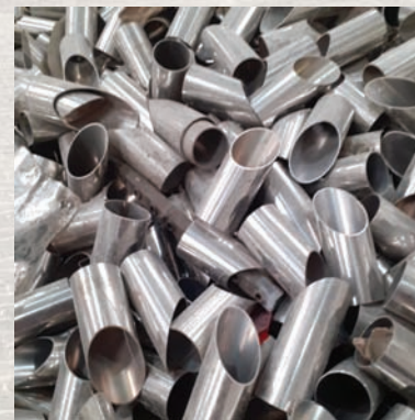
Stainless Steel Scrap