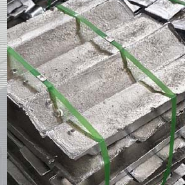
High Antimony Lead Ingots