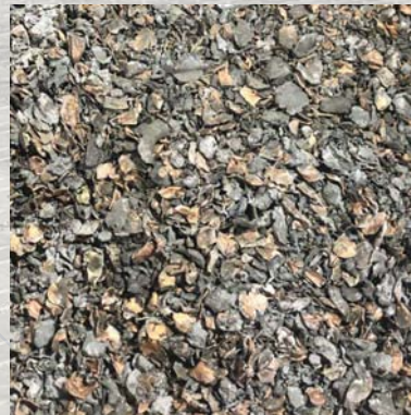
Range Lead Scrap