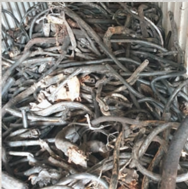
Lead Copper Cable Scrap