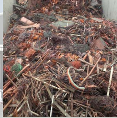
Mixed Copper Scrap