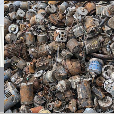
Motors + Compressors