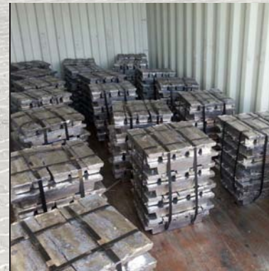
Remelted Lead Ingots