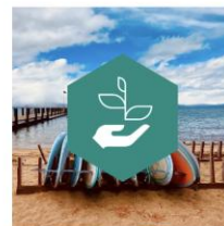
ENVIRONMENTAL STEWARDSHIP AND HUMAN IMPACT MITIGATION