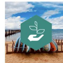
ENVIRONMENTAL STEWARDSHIP AND HUMAN IMPACT MITIGATION