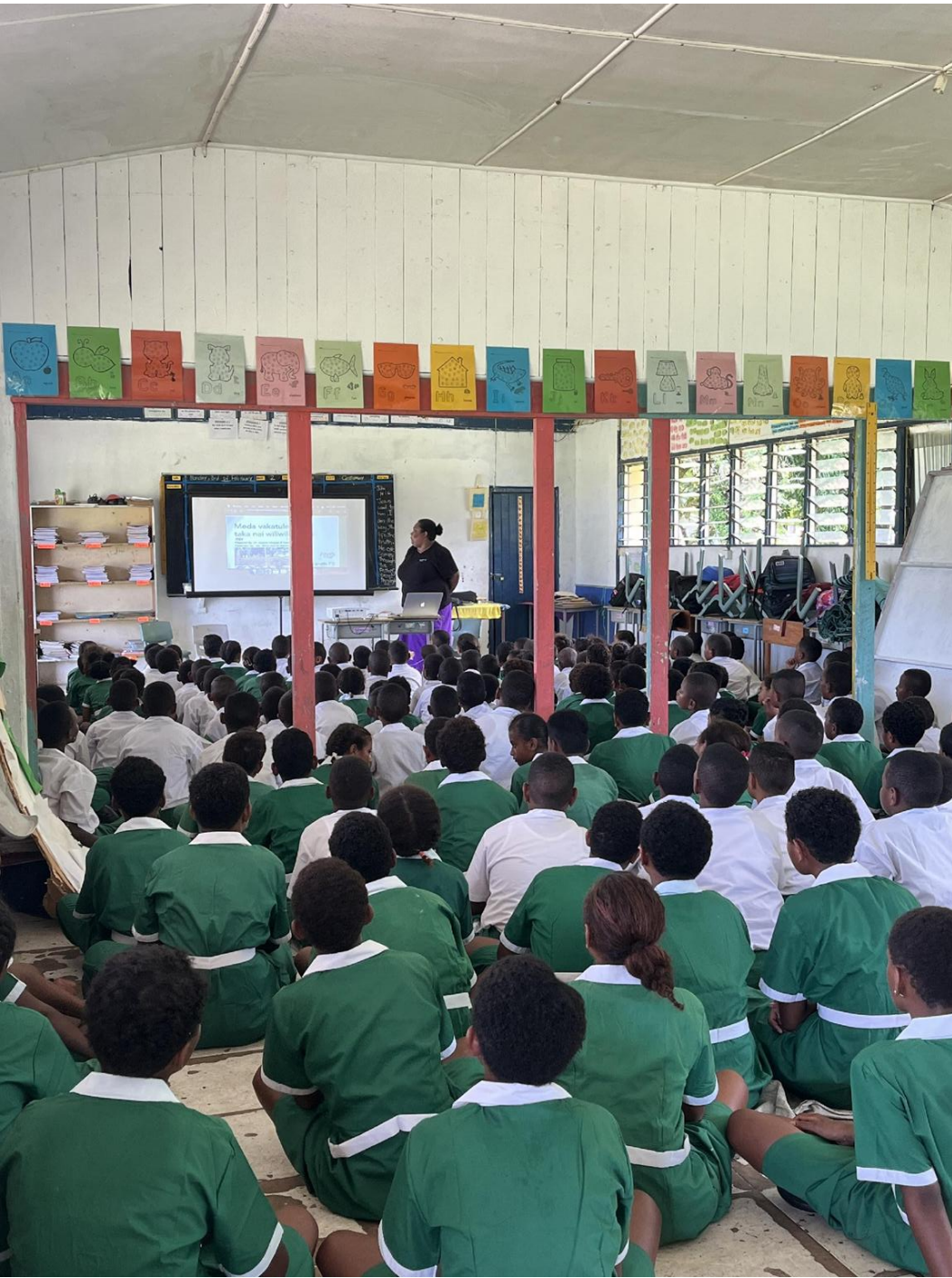
Education & Awareness: Education in the local school. Skill training to our hosts.