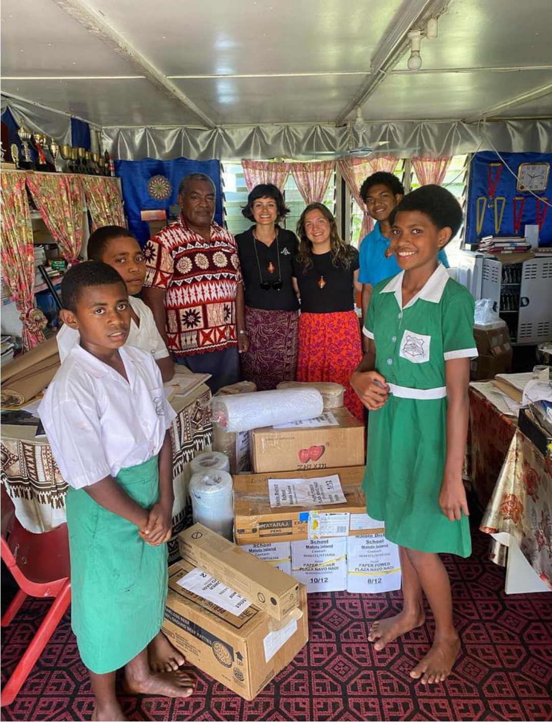
Community Resilience: Improving infrastructures. Donating school supplies and medical equipment.