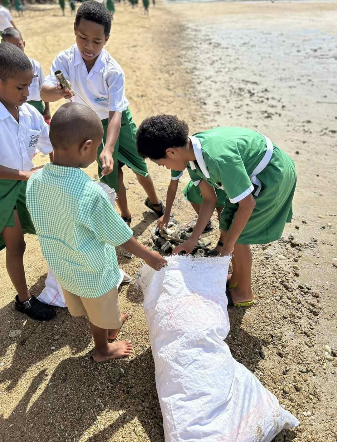
Waste Management: Clean-up campaigns. Waste separation training. Pilot project for waste management.