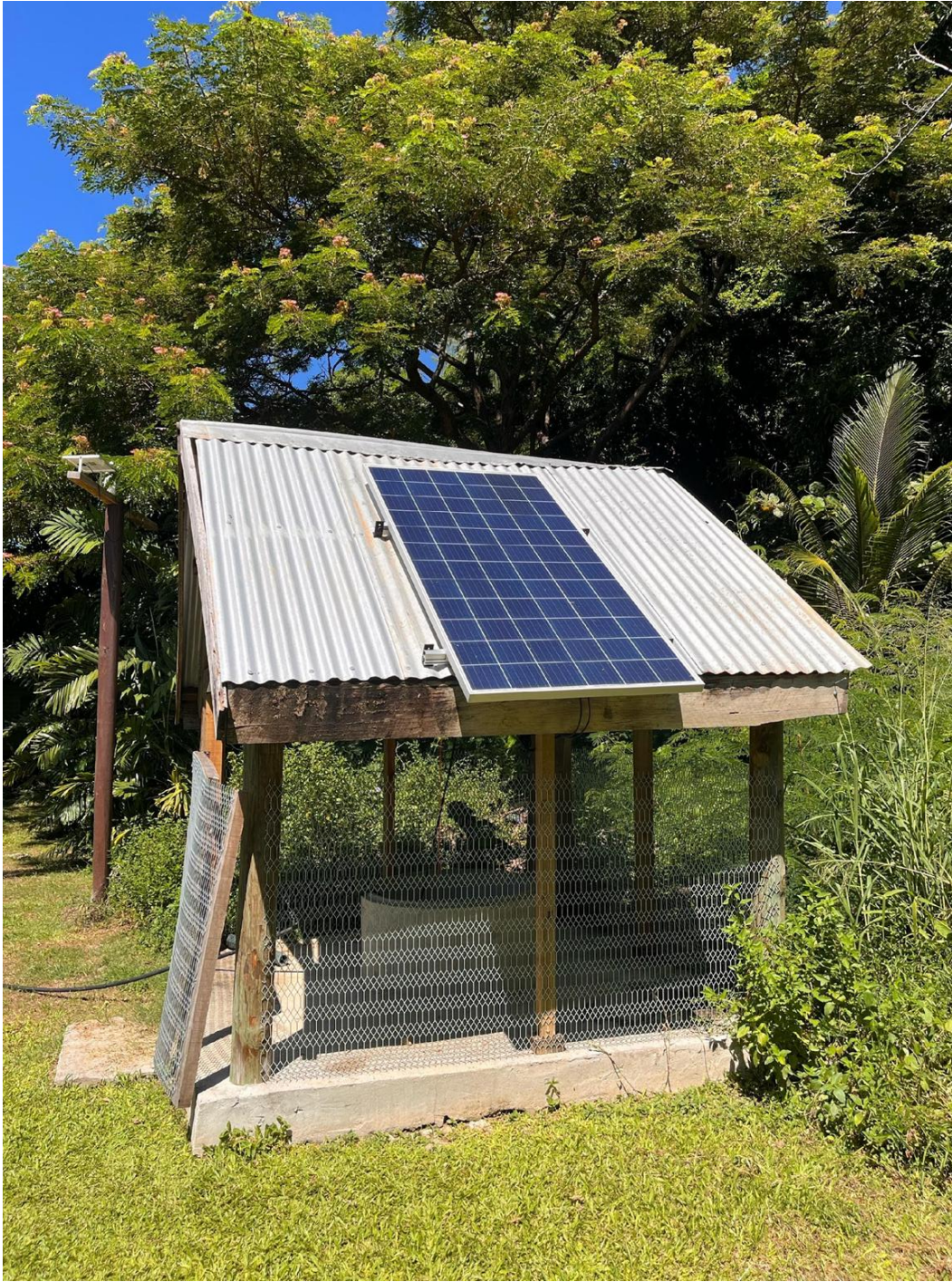
Water4All: Water tanks for rainwater. Solar water pump installation.