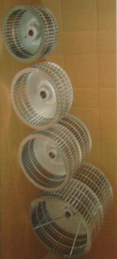
2000-7000 SERIES FANS

AgTec offers three different fan sizes to fit your tractor and your needs. From the 3000 series requiring only 45 HP up to the big 7000 series requiring 120+ HP all of these fans produce a 190 MPH+ airstream. When paired with the proper AgTec head, these "squirrel cage" fans allow our sprayers to fit both your tractor and your spray requirements. An "AirFlo" squirrel cage blower insures uniform chemical suspension and distribution, moving up to 15,000—30,000 cu. ft. air per minute at up to 200 miles per hour air velocity. This allows spraying even in adverse wind conditions.