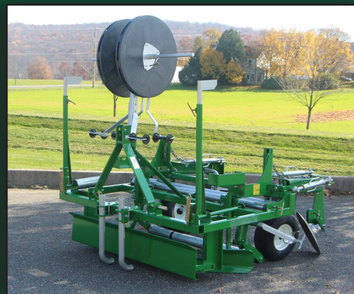
Showing leveling blade and trench opener