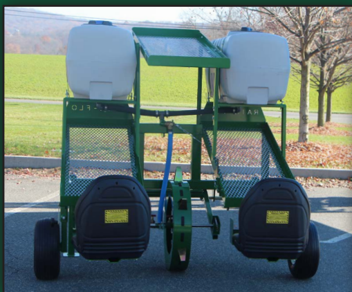
Notice: fully open back