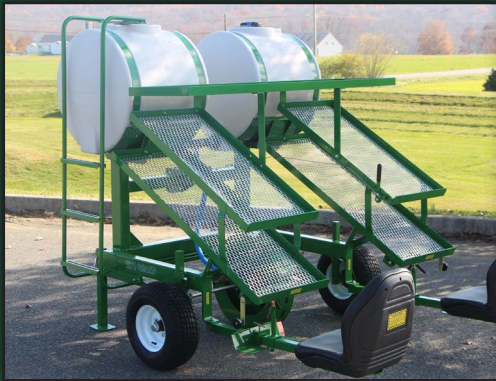
Optional top tray & side ladder