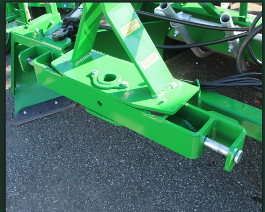
New Ro-Trak Steering Bar