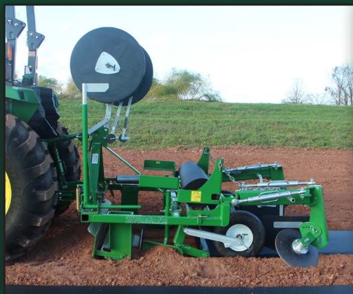
Ideal for smaller tractors