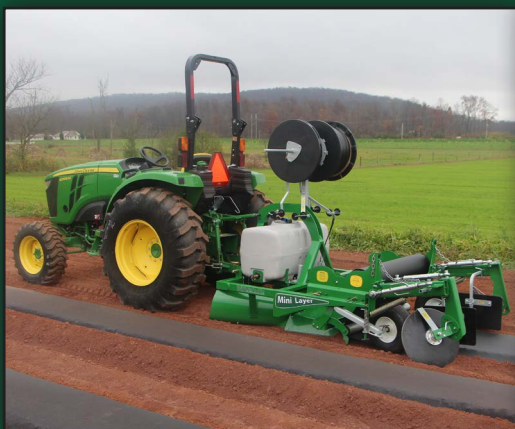
Designed for compact tractors