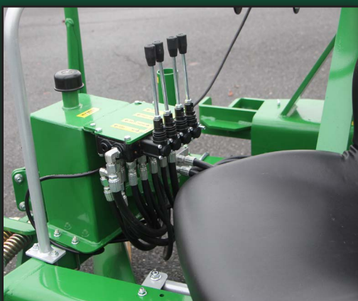
Hydraulic Cover Disk Adjustment