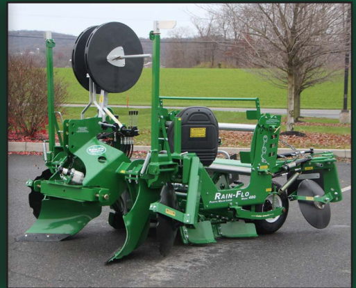
New Concept For Firmer Bed