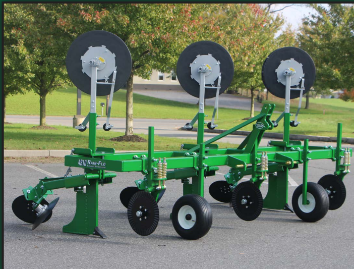
Replaceable shank tooth