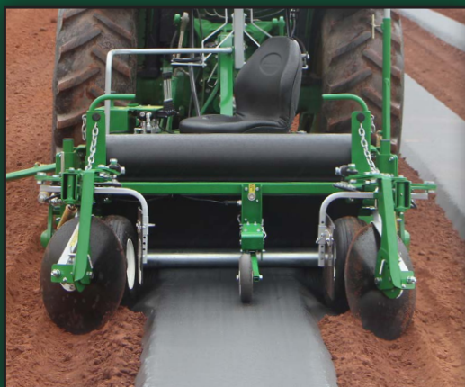
Automatic Ro-trak Sensor