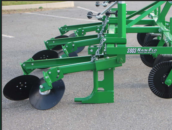
Abrasive resistant opener on shank