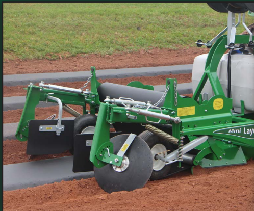
Turnbuckle Disk Adjustment