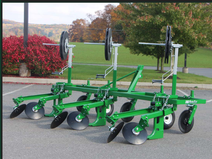
Roller guides to prevent tape twist