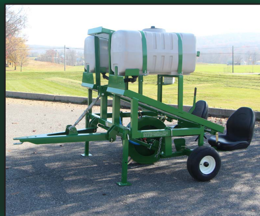
Optional trailer hitch