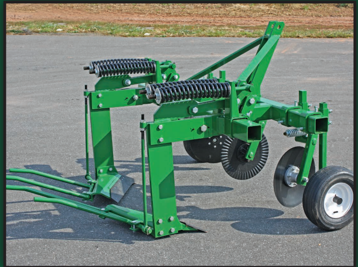
Automatic Reset Lifter