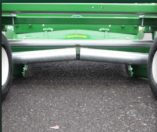
Crowned Raised Bed