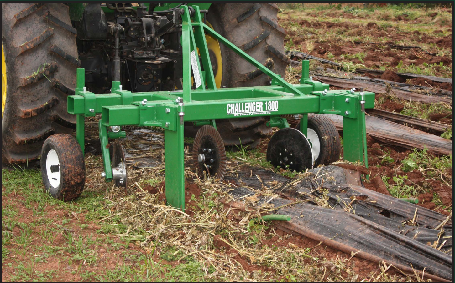
Model 1800 Mulch Lifter