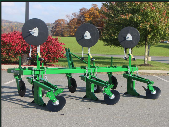
Roller guides to prevent tape twist