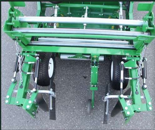
User Friendly Disk Adjustment