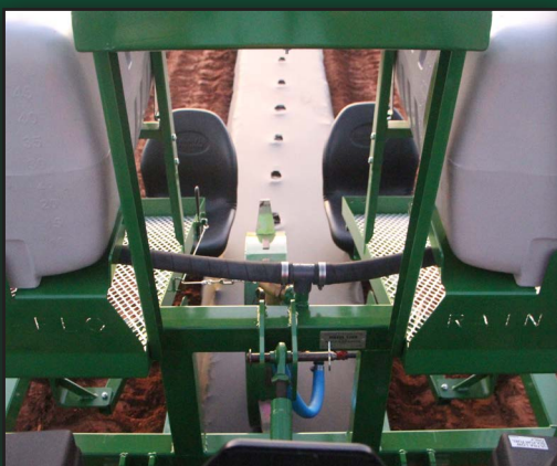
Clear view to the plastic row!!