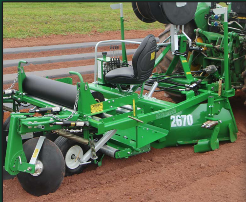
Redesigned Side Chisel