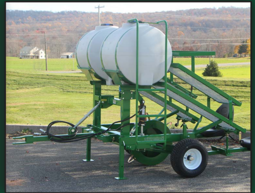
Optional trailer\3-point combination