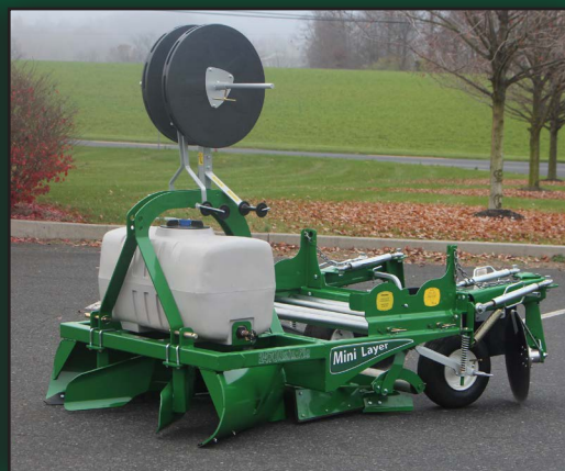
Model 2470 with center fillers