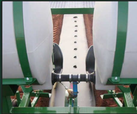
Clear view to plastic row!!