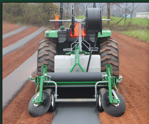
Ideal for small acreage