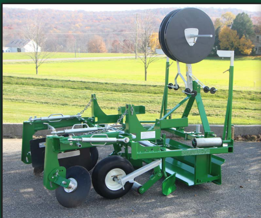
Model 2370 flat bed layer