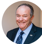
Gen. Philip M. Breedlove, U.S. Air Force (ret.) Former Supreme Allied Commander Europe