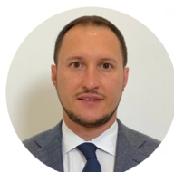
Yaroslav Demchenkov Deputy Minister of Energy of Ukraine