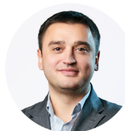
Oleksandr Borniakov Deputy Minister of Digital Transformation of Ukraine