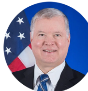
Stephen Biegun United States Deputy Secretary of State