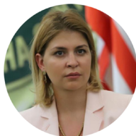
Olha Stefanishyna Deputy Prime Minister for European and Euro-Atlantic Integration of Ukraine