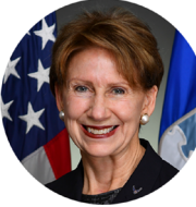
Barbara Barrett Secretary of the United States Air Force