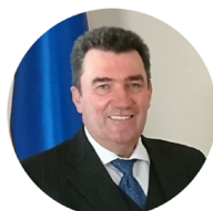
Oleksiy Danilov Secretary of the National Defense and Security Council of Ukraine