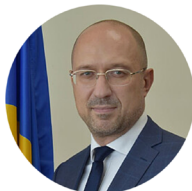
Denys Shmyhal Prime Minister of Ukraine