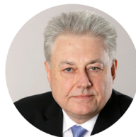
H.E. Ambassador Volodymyr Yelchenko Ambassador of Ukraine to the United States