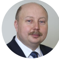
Oleh Nemchinov Minister of the Cabinet of Ministers of Ukraine