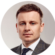
Serhiy Marchenko Minister of Finance of Ukraine