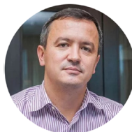
Ihor Petrashko Minister of Economic Development, Trade, and Agriculture of Ukraine