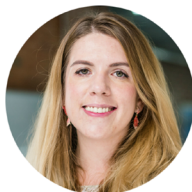
Kira Rudyk Member of the Parliament of Ukraine Leader of the 'Voice' Political Party Former COO of Ring Ukraine