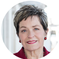
Congresswoman Marcy Kaptur United States Congresswoman for Ohio's 9 th District (D) Co-Chair of the Congressional Ukrainian Caucus