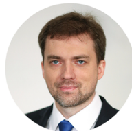
Andriy Zahorodniuk Former Defense Minister of Ukraine