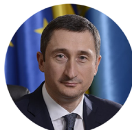
Oleksiy Chernyshov Minister of Regional Development of Ukraine