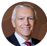
Gen. Wesley K. Clark, U.S. Army (ret.) CEO of Wesley K. Clark & Associates Former Supreme Allied Commander Europe