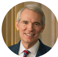
Senator Rob Portman United States Senator from Ohio (R) Co-Chair of the Senate Ukrainian Caucus