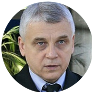
Valeriy Ivashchenko First Deputy Minister for Strategic Industries of Ukraine