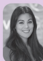
Ambrosia Carey Olivia Garden* Timeless Beauty: Cutting, Styling & Finishing Technique 2:30-3:30pm ET 1:30-2:30pm CT 11:30am-12:30pm PT