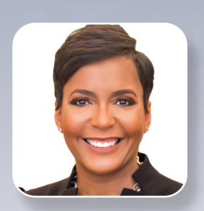
The Honorable Keisha Lance Bottoms