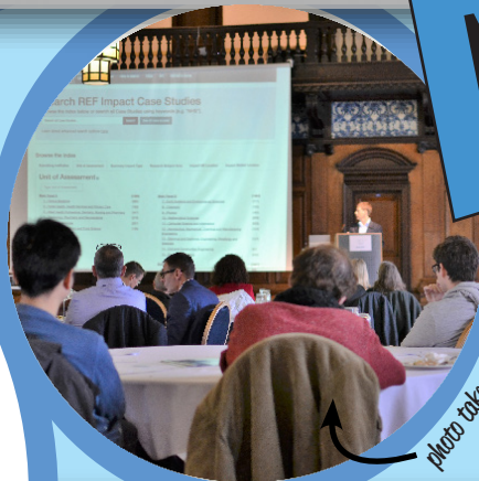
photo taken from our impact event