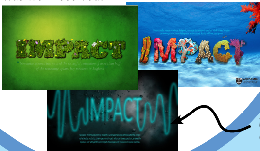
flyers from our event

In November 2015 we held RISE2015 (Research Impact in SAgE 2015), to both celebrate previous achievements and raise awareness of impact • 90% fed back that they would like a similar event organised in the future. • short presentations of impact projects with an interactive vote to decide the impact champion was well received.