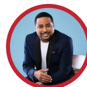
Pastor Smokie Norful