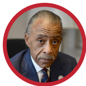
Rev. Al Sharpton

A discussion exploring the systemic barriers that prevent black men from becoming medical doctors.