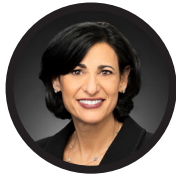
Rochelle P. Walensky, MD, MPH

Exploring the significance of race in healthcare outcomes in the American medical system.