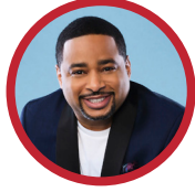
Pastor Smokie Norful