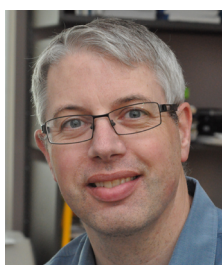
CSEM Section Co-Chair