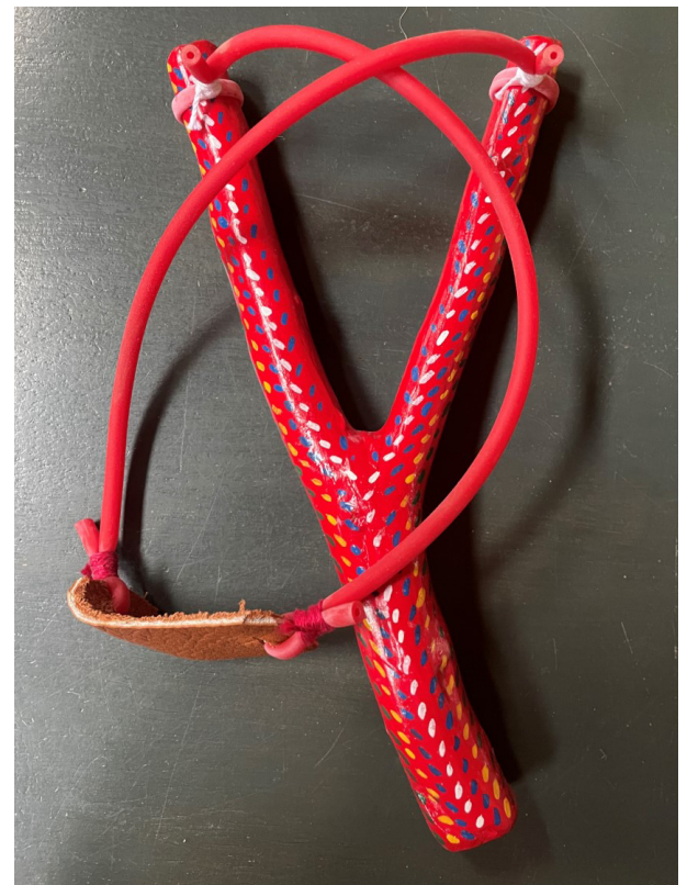
Artist 3: Will Goodon — Red River Métis, Manitoba Métis Federation Minister of Housing, aspiring artist.