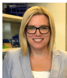
Scientific Section Co-Chair