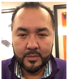
Indigenous Science and Content Co-Chair