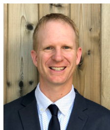
Allied Health Section Co-Chair