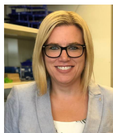
Scientific Section Co-Chair