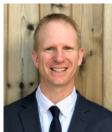
Allied Health Section Co-Chair