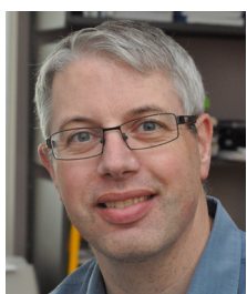
CSEM Section Co-Chair