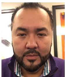
Indigenous Science and Content Co-Chair