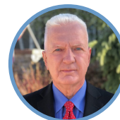
Brett Giroir, MD