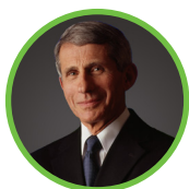
Anthony Fauci, MD

A message from Dr. Anthony Fauci about COVID-19 and the Coronavirus.