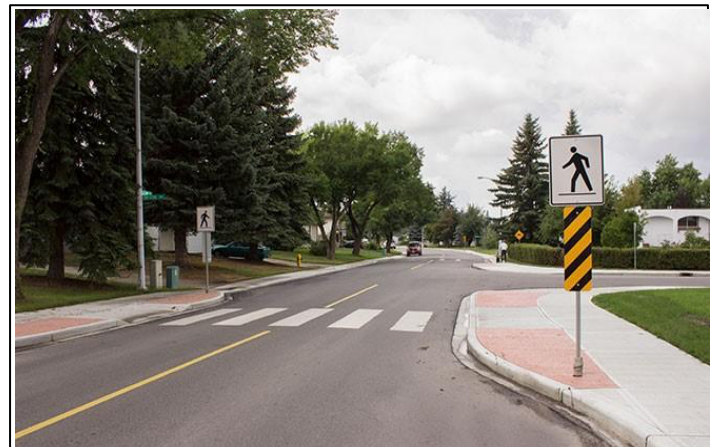
Example of a curb extension. Source: Strathcona County, 20221