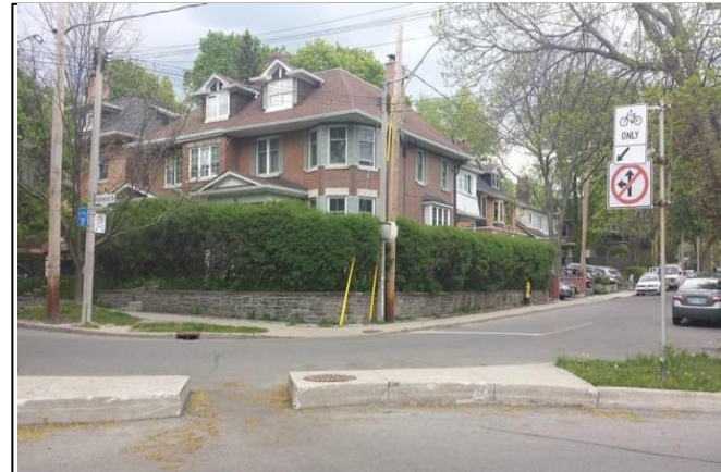
Example of traffic diversions

https://safety.fhwa.dot.gov/ped_bike/univcourse/pdf/swless11.pdf