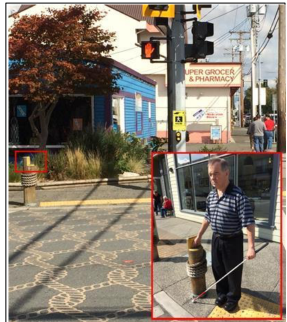
A good example of a raised intersection with accessible pedestrian signals and attention TWSIs. The top of the bollard is cut to indicate the direction of crossing.

Ensure to provide line markings on the road surface to identify where vehicles should stop when the pedestrian crossing is being used.