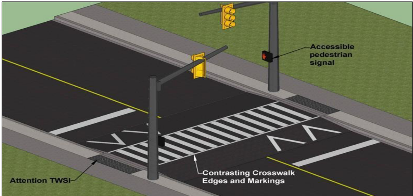
Raised pedestrian crossing at a mid-block crossing.

2. Speed humps/bumps: Speed humps are raised bumps in a roadway are used to reduce traffic speeds. These bumps must be kept well maintained as they can be a hazard for both drivers and bicycles if they are not designed correctly and properly maintained (FHWA ,n.d).