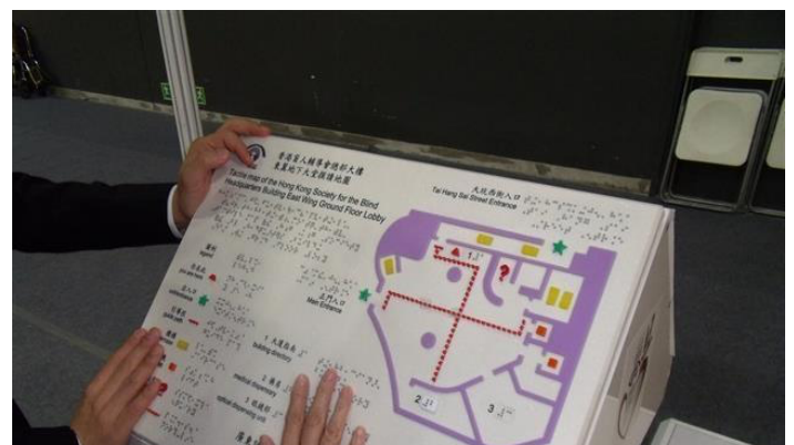
A tactile directory and map located on an inclined podium featuring braille and tactile lettering. The map incorporates colours and shape coding to identify key elements and routes. The directory also provides audio information through the push of a button.

Tactile maps or pre-recorded instructions can help people impacted by blindness find their way independently in complex buildings or groups of buildings. There are two main types of tactile maps: large-scale maps that provide information about the general layout and small hand-held maps that give specific route information.