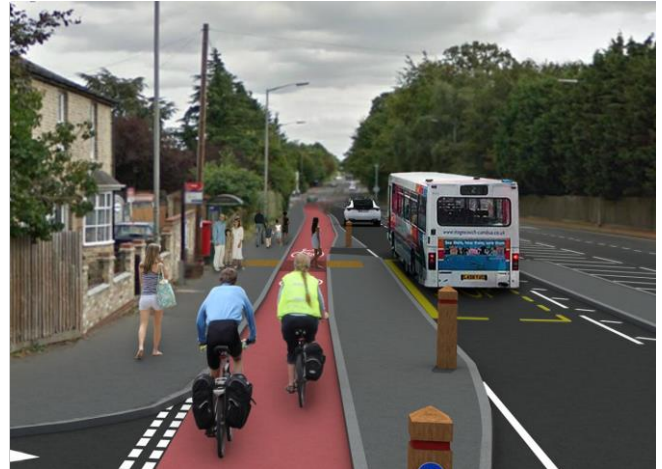
Example of a bus stop bypass in Cambridge.

The introduction of such infrastructure has resulted in distress for people with disabilities as getting to and from the bus stop is a serious safety risk.