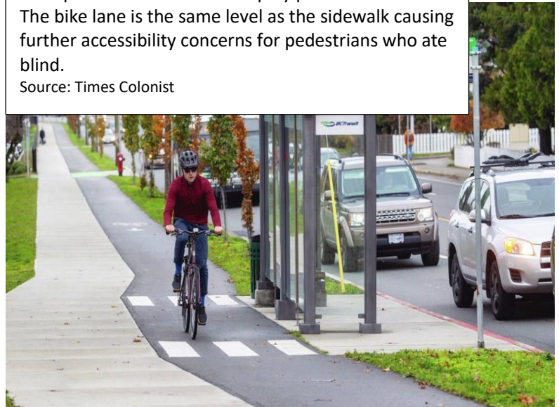
Example of one of the bus stop by pass in Victoria. The bike lane is the same level as the sidewalk causing further accessibility concerns for pedestrians who are blind.

Victoria’s bike lanes are also designed at the same level as the sidewalk, creating further navigational challenges for people who are blind.