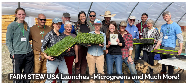
FARM STEW USA Launches -Microgreens and Much More!

A story from Steven Conine, FARM STEW USA Volunteer