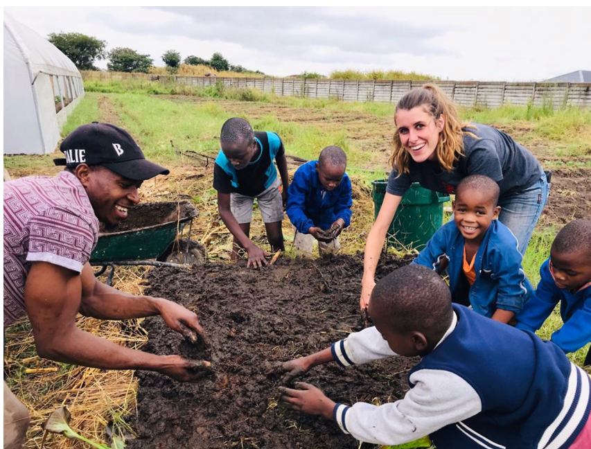
International Agriculture Development students worked with orphans in Zimbabwe to prepare a vegetable garden, and learned date production in Israel.

gram with the goal of preparing students to work with non-profit aid organizations that improve food security.