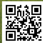
SCHOOL OF NURSING & HEALTH PROFESSIONS