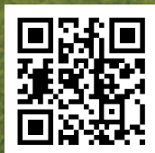
SCHOOL OF BUSINESS AND ADULT & CONTINUING EDUCATION