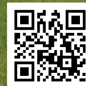
SCHOOL OF RELIGION