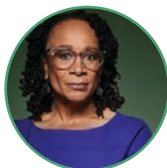
S. Epatha Merkersen

A testimonial about life with Type II Diabetes.