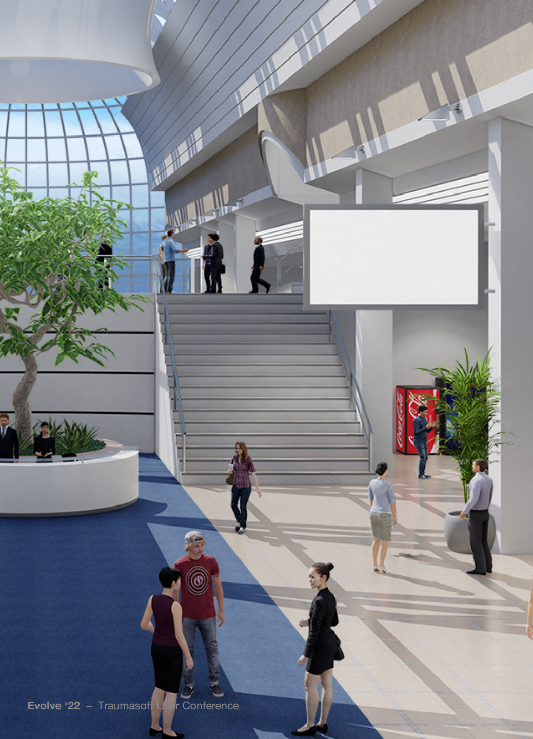
Evolve '22 – Traumasoft User Conference