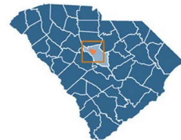
Reference map of the 29203 zip code within Richland County and the state.

From 2016 – 2020, 41,000 residents (approximately 10 of every 10,000) in 29203 received a lower limb amputation due to damage from diabetes. The largest group of residents in 29203 are Black (81.8%) and are cut off from basic services that might help reduce disparities and save their limbs and lives. One-third live in poverty.