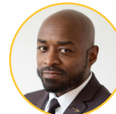
Hon. Dupre' Kelly