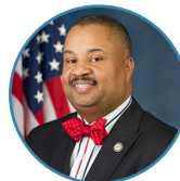
Hon. Donald M. Payne, Jr.