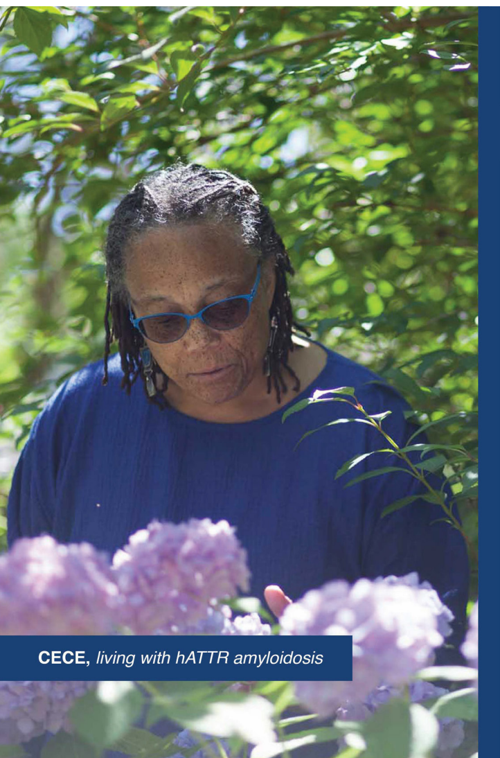
CECE, living with hATTR amyloidosis

Do you or your family have a history of Numbness in hands and feet? Carpal tunnel syndrome? Digestive issues? Dizziness, shortness of breath?