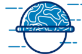
Active Duty Military