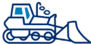
Machinery & Equipment